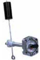
ROCHESTER Float Gauge JUNIOR Special 6281