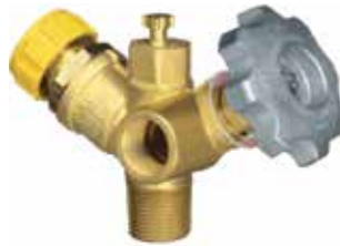
ASME Multivalves® for Vapor Withdrawal - 7556R